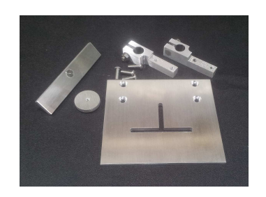
RCBS Pro Melt Assembly Instructions