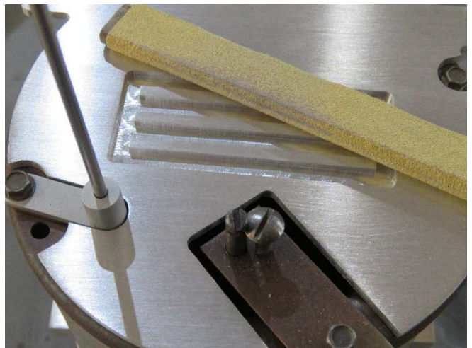
120 sandpaper on curved wood.

Tip: Start with a small pilot drill bit in center and work up to final size. .125" to .404" used above in 5 steps. Cut straight lines with hack saw, band saw or rotary tool. Use 120 sandpaper on rounded wood to smooth out.