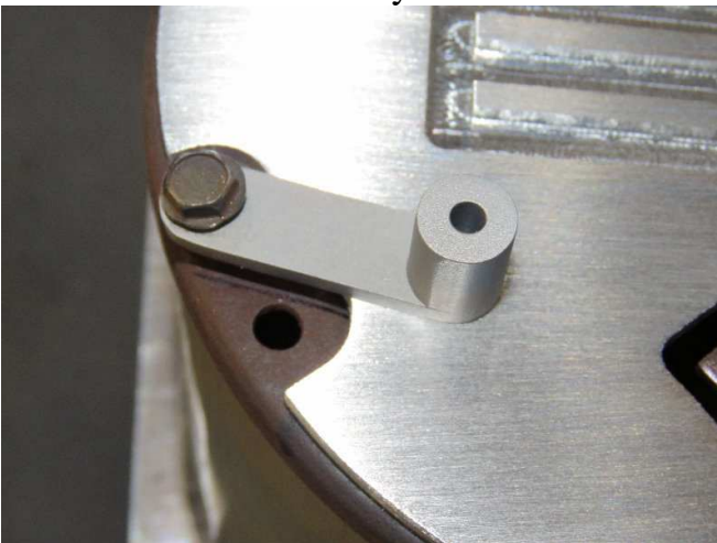
Remove the float, install lid.