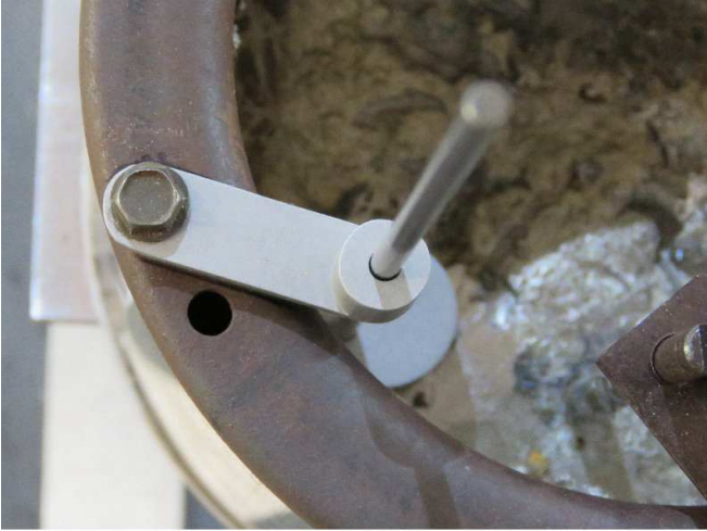
Install where you want.