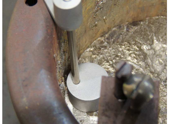
Leave about 1/16" off wall.